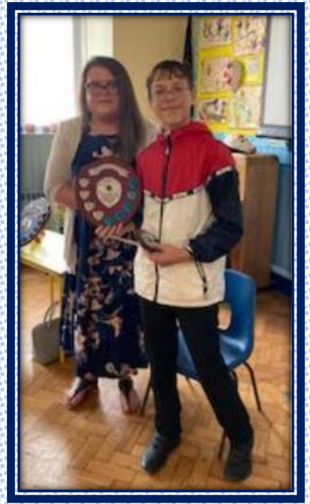
Kindness Award Phoenix