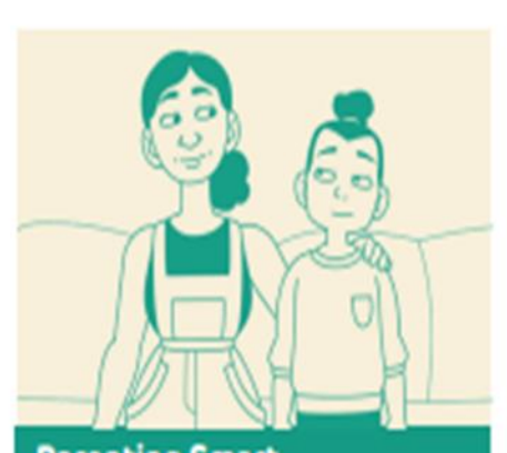
Parenting Smart Our website full of practical advice and tried and tested tips for parents and carers of primary-age children.

Family Practitioners Each Place2Be primary school has access to a dedicated Family Practitioner offering specialist support and training.